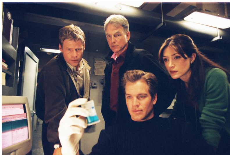
NCIS, Season 1

Today, and first premiering on Global back in 2003, NCIS is one of the longest-running shows currently airing in primetime and it is back for an astounding 21 st season starting Monday, February 12 at 9 p.m. ET/PT on Global and STACKTV. Global's winter lineup also welcomes new drama Elsbeth , a spinoff of The Good Wife , starring EMMY® award winner Carrie Preston in the fan favourite titular role premiering Thursday, February 29 at 10 p.m. ET/PT . This coming season also sees the return of Top 10* hit CSI: Vegas on a new night Sunday, February 18 at 10 p.m. ET/PT . More returning fan favourites back this winter include Top 20* blockbuster Fire Country on Friday, February 16 at 9 p.m. ET/PT and Top 5* ranked 9-1-1 on Thursday, March 14 at 8 p.m. ET/PT .