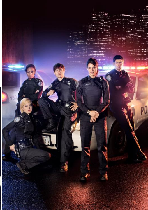
From left to right: Private Eyes, Season 1 and Rookie Blue, Season 1