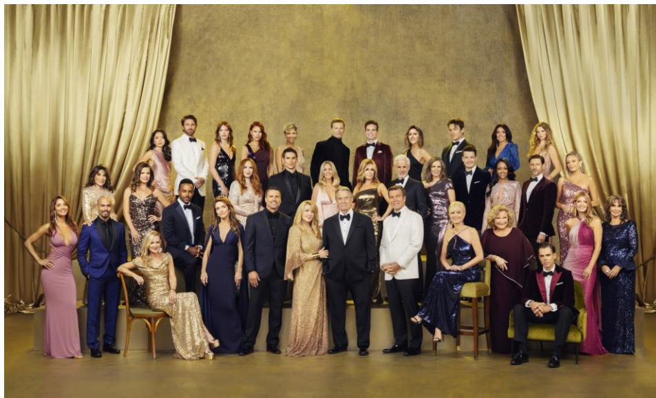
The Young and the Restless 50 th Anniversary